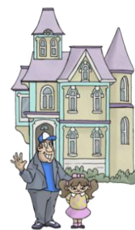
Graphic Created by: Jason Lutes, College@ESDC

It is up to the user to ensure permission has been obtained from everyone with an interest in the photo.